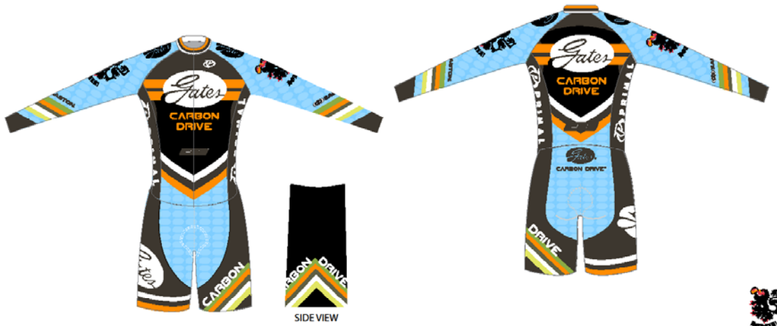
Team Gates Carbon Drive racing kit